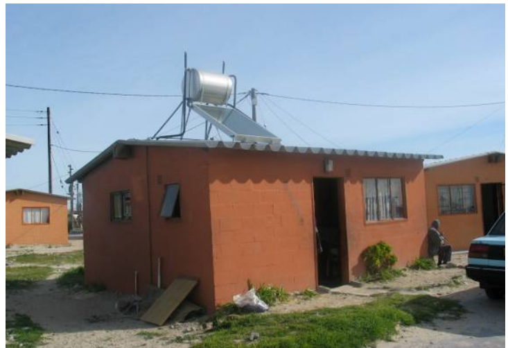
Figure 3.3 Social housing with subsidised solar water heater