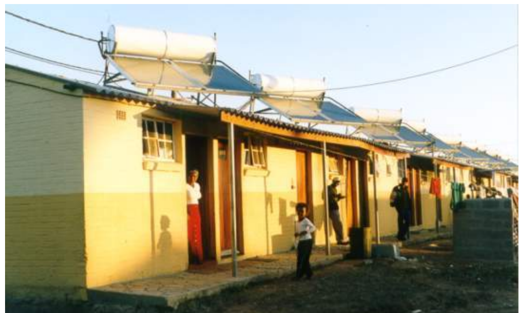
Figure 3.2 Solar water heaters on family units of a social housing complex near Cape Town